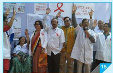
World AIDS Day, 2016 Activities. 02-03. Ajmer; 04-06. Gauhati Medical College, Guwahati; 07-09. GMC. Bhopal; 10-11. Osmania Medical College, Hyderabad, Telangana; 12. Patna Medical College, Patna; 13-14. Saraswati Institute of Medical Sciences, Hapur; 15. West Bengal.